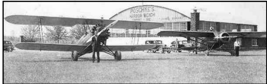
Once a hustling and bustling airport 90 years ago, now consigned to the pages of history

A very successful airport, it was used extensively as a passenger destination point, cargo shipments, civilian usage, and flying lessons. it attracted huge crowds at annual fly-ins similar to the Air-Port-Hope Fly-ins. during the war years the government imposed temporary restrictions for civilian aircraft and the Poschke airport was temporarily restricted and limited